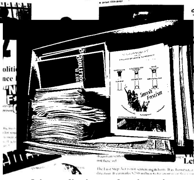
The First Step Act is not sentencing reform. It is, however, a giant leap in the direction of ending the war on drugs.

Print media, especially newsletters and newspapers, enabled prisoners to organize and educate. The San Quentin Rebellion of 1968 started after articles published in the prison newspaper The Outlaw circulated prisoners' grievances. The Outlaw was republished by The Berkeley Barb , an underground, radical newspaper. This led to more publicity and over 75% of the prisoners at San Quentin joining the work strike. The more recent successes of the California Hunger Strike demonstrate the importance of print media.